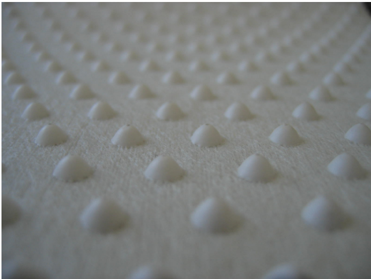
Trans-Textil is constantly involved in enhancing its applications-oriented VAP® membrane by means of its proprietary textile technologies. Integrating several VAP® stack layers into one, as in its VAP® Multilayer, significantly facilitates handling in the production of lightweight parts. The product line features spacers in the form of small raised nubs, which are applied to the resin barrier by means of proprietary coating technology for optimum vacuum distribution and thus faster removal of trapped air and volatiles.