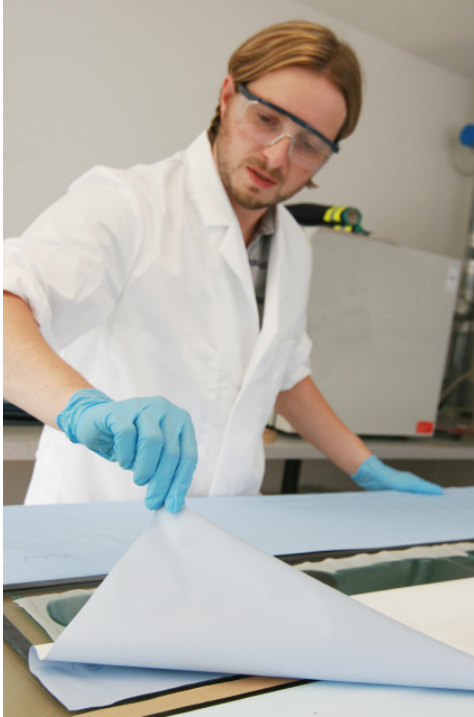
At its in-house VAP® laboratory, Trans-Textil tests the quality of its membrane systems under realistic infusion conditions.